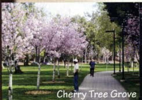
Cherry Tree Grove

Reminder! Vehicles are subject to tow if parked on private parking lots including the Puente Hills Mall.