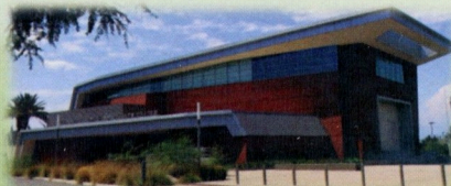
Our new Hacienda Heights Community Center and site of our annual January meeting.