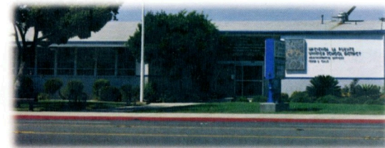
Our meeting site at the HLPUSD office.